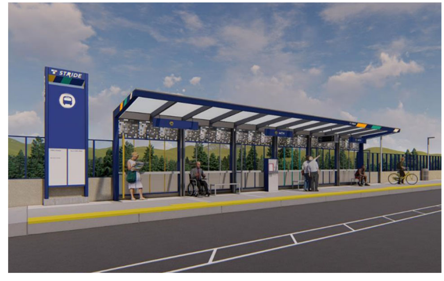
Example Stride freeway station