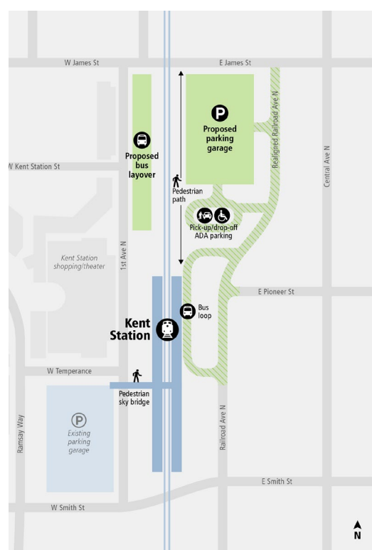
Figure 1 Early Conceptual Project Layout