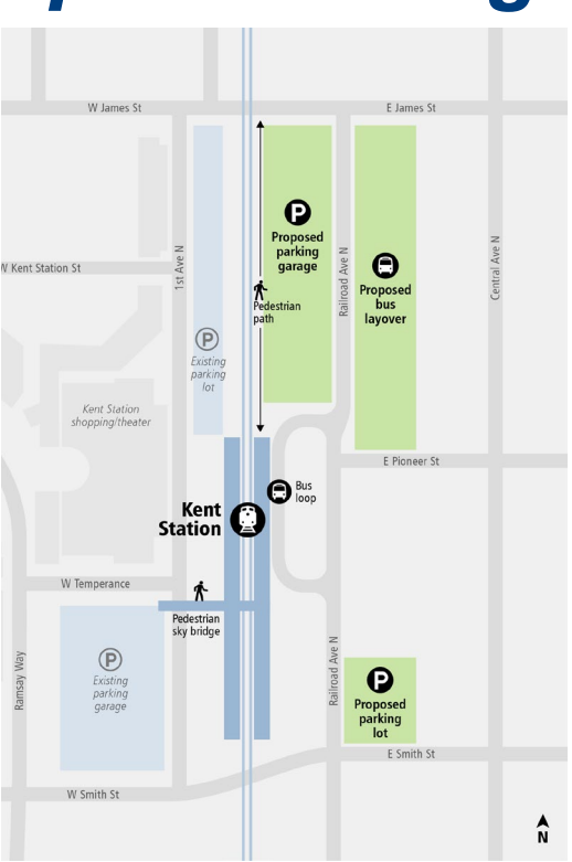
Figure 2 Current Proposed Project Layout