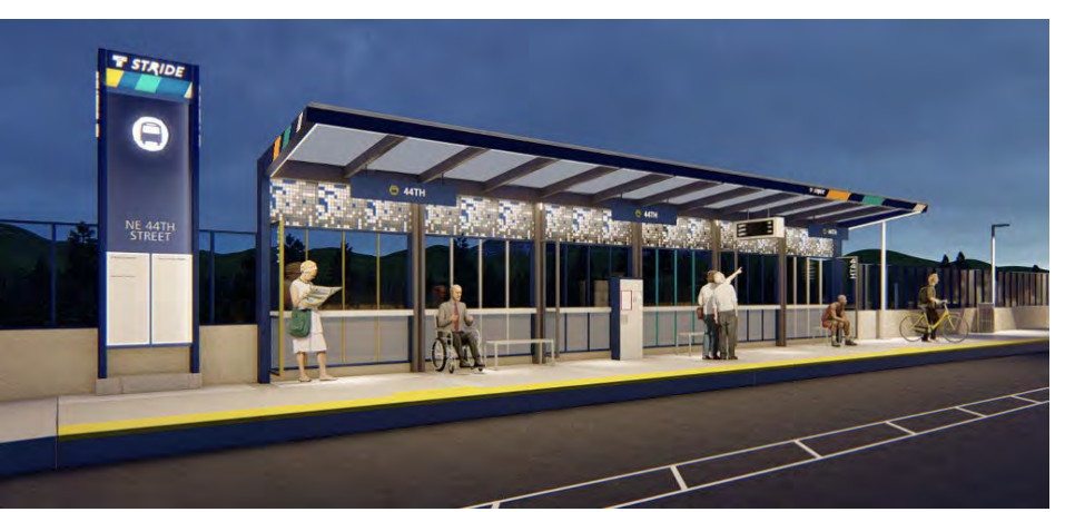
Typical in-line station