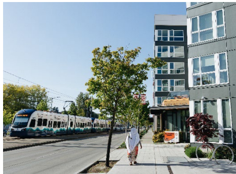
Zoning and local coordination