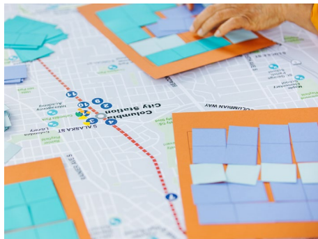
Prioritization of public benefits