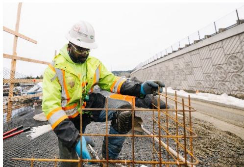
Local infrastructure resources