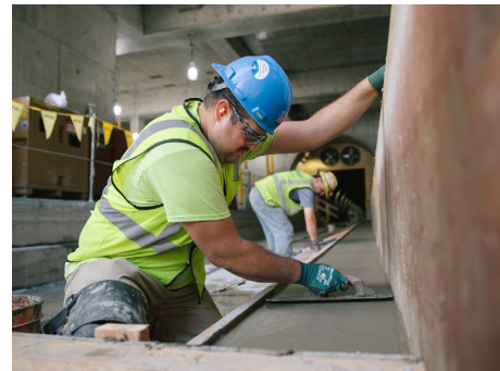
Design and delivery of transit facilities