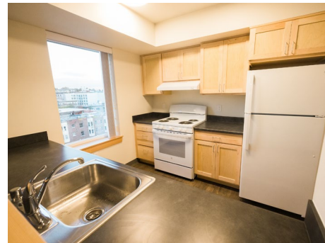
Funding for affordable housing