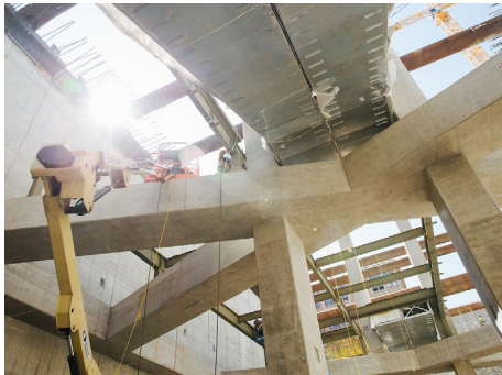
Upfront investment requirements