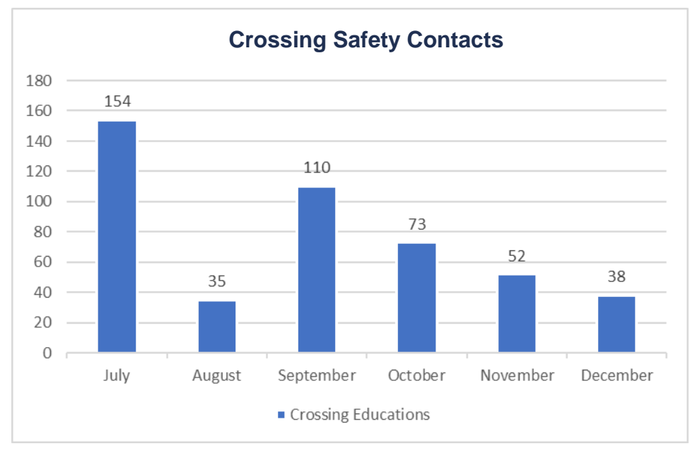
Data is through 12/24/2023