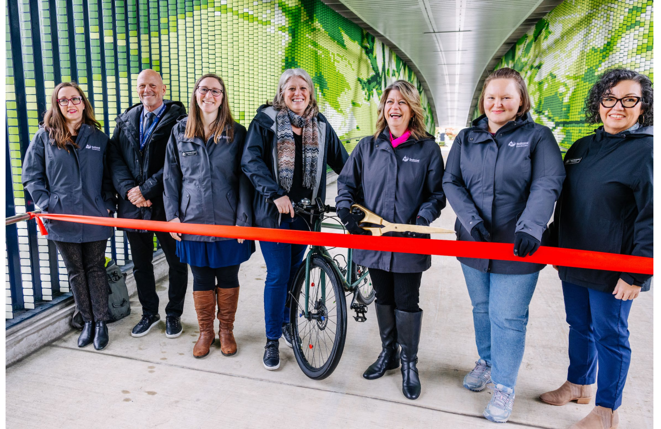
Overlake Village Station Pedestrian Bridge Crossing SR-520 Opening Day