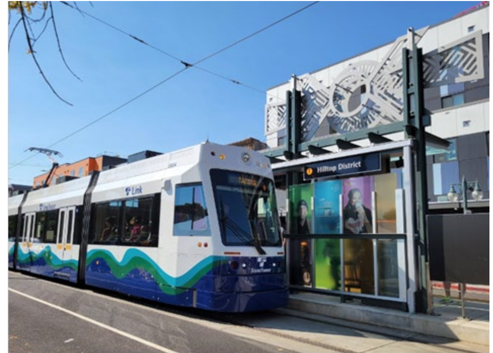
Open for Revenue Service