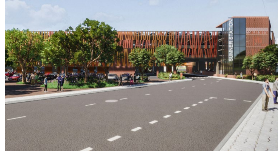
Sumner design-builder's proposal rendering