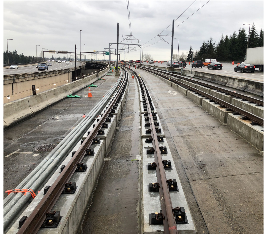
Completed Track on East Channel Bridge Looking West