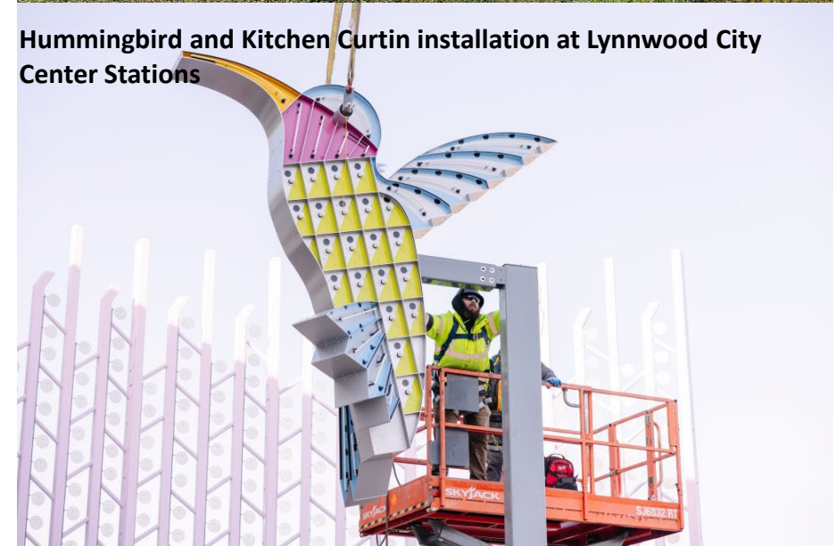
Hummingbird and Kitchen Curtin installation at Lynnwood City Center Stations