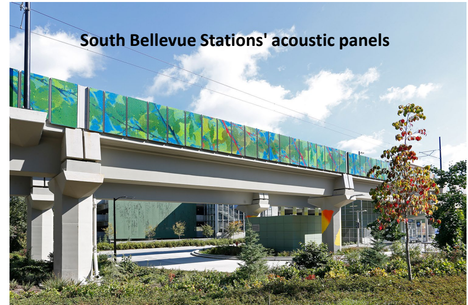
South Bellevue Stations' acoustic panels