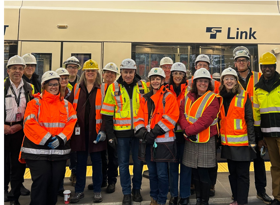
Daytime Test Train – December 18, 2025